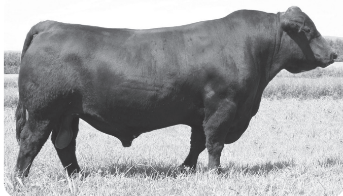
JRI Optimizer 148A24

■ This beef machine homozygous polled Judd Ranch herdsire was selected out of the fall '07 bull calf crop. Pop A Top featured an incredible low birth to growth spread with his calving ease 74# birth weight coupled with his scalebusting 787# 205 day weight. Pop A Top's 787# 205 day weight ranked #3 out of 123 contemporaries and breeders, his super dam was a first calf heifer. Pop A Top is a breed trait leader for Heifer Pregnancy, Scrotal, Yield Grade, and (lean) Fat. The first Pop A Top daughters calved in the spring of 2012 and man oh man they were fertility plus/calf raising machines. Calving ease/powerhouse sons out of Pop A Top & Pop A Top clones sell in this offering.