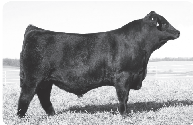
Meatwagon Judd Ranch 2019 Sale Bull