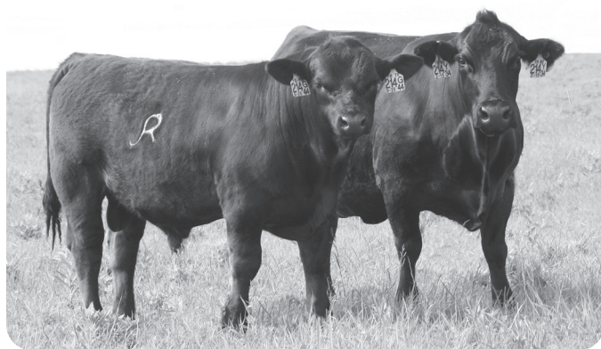
9 Yr Old JR Mama With Her Scalebusting Bull Calf