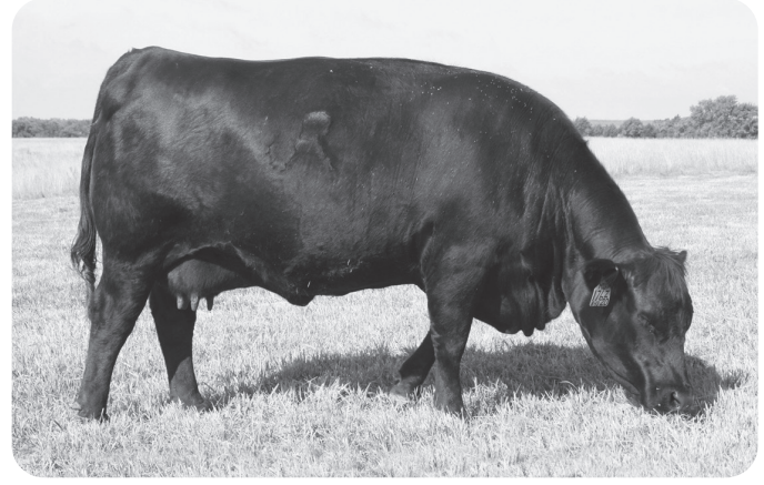
Calf Raising Machine Judd Ranch First Calf Heifer

B HP Balancer Bull Whopping 1,254# YW CE Deluxe 82# BW 16.1" Ylg Ribeye/4.2 IMF 9-Year-Old Calf Raising Machine DOM Honored Dam