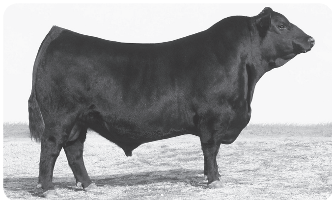
MCCA Capitol Hill 516C

JRI Reference Sire Homo. Black, Homo. Polled (25%) Balancer