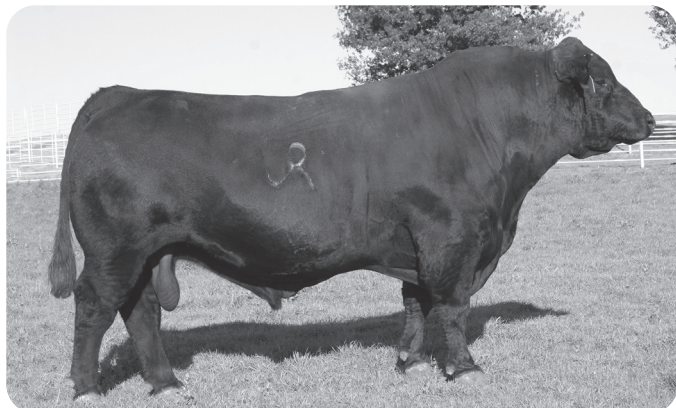
JRI Painted Black 254C741

■ This calving ease/powerhouse SAV Resource 1441 son was Judd Ranch's pick of the 2017 Balancer bull calf crop. Real McCoy's fertility-plus/calf raising machine 11-year-old dam JRI Ms Secret Crush 270W93 possesses a remarkable 369-day annual calving interval. Super mom Ms Secret Crush flat knows how to spread calving ease deluxe, low birth weight with explosive performance. To date, Ms Secret Crush's nine babies have posted the following phenomenal birth to growth spread averages: 78# birth weight, ripping 731# 205-day weight along with a whopping 976# actual weaning weight, scalebusting 1,245# yearling weight spread on her four sons. Real McCoy is proving to be a calving ease deluxe sire at Judd Ranch and man oh man, the Real McCoy progeny are mighty impressive.