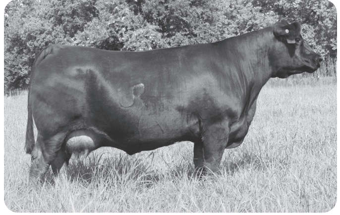
Judd Ranch Females are "The Complete Package"

B HP Balancer Bull Whopping 1,319# YW CE 84# BW Big-Time 5# Gainer Humongous 17.3" Ylg Ribeye/Powerful DOD Cow Family