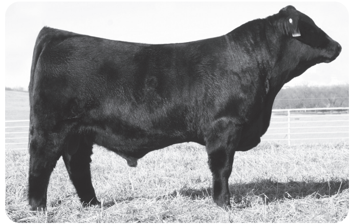
Beef Machine Judd Ranch 2019 Sale Bull

361-Day CI Second-Calf Dam/3 DOM Honored Grandams