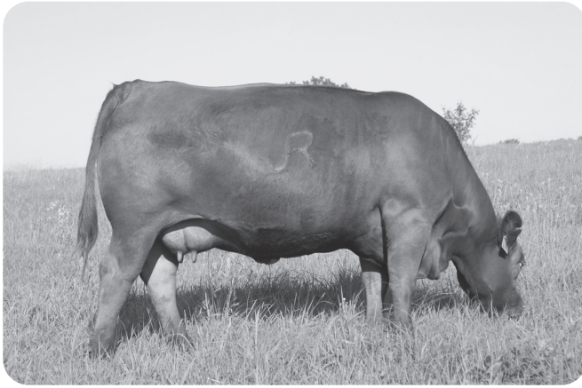
This JR Beauty Produced Scalebusters for 15 Years