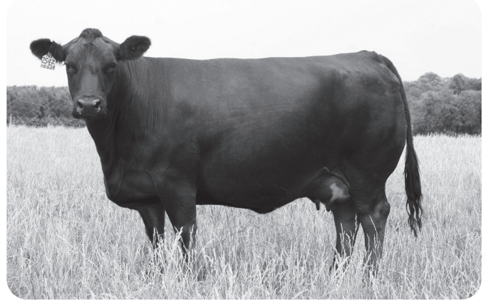
Judd Ranch Females Feature Unmatched Phenotype