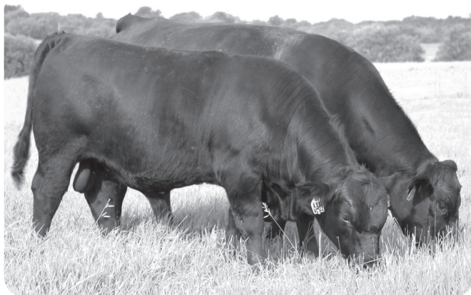
Judd Ranch First Calf Heifer With Her Powerhouse Bull Calf