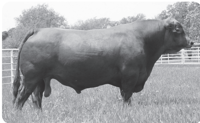
JRI Prescribed Remedy 253E38

■ Producers, no sire has ever made the impact at Judd Ranch like Top Secret (deceased) and you will find this one-of-a-kind producer in basically every Judd Ranch herdsire's pedigree. Top Secret produced some awesome sons and daughters for Judd Ranch and Top Secret was honored numerous times as a breed trait leader for calving ease, (low) birth weight and pregnancy @ 30 months. Top Secret's calving ease/ meat machine sons were always crowd favorites in the annual Judd Ranch bull sale. Today Top Secret's calving ease/meat machine grandsons, sired by Secret Instinct and Pop A Top and great grandsons, sired by General Patton, Prescribed Remedy, Bandito, and Painted Black just to name a few, are also crowd favorites. This comes as no surprise with the unbelievable beef, butt, guts and nuts they possess.