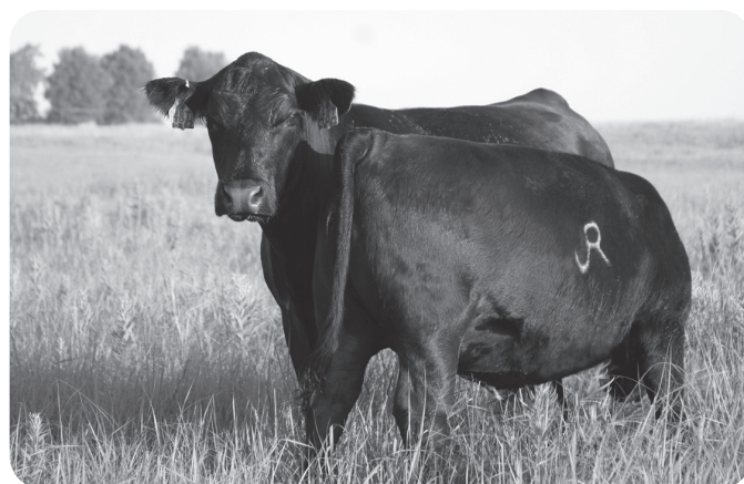
Judd Ranch First Calf Heifer Nursing Her Awesome Heifer Calf

DB HP PB Secret Instinct 2 Son Scalebusting 1,291# YW CE Deluxe 68# BW Big-Time Gainer 99 T & U First-Calf Dam/Powerful DOD Cow Family