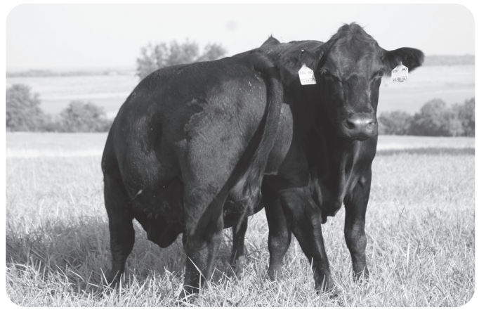
JR Dam of Distinction Mama Nursing Her Whopping Bull Calf

HB HP Balancer Bull Scalebusting 1,413# YW CE Deluxe 81# BW Big-Time 5# Gainer 19.1" Ylg Ribeye/4.6 IMF/99 T & U Second-Calf Dam