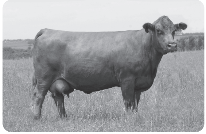
Judd Ranch Mama Photographed at 10 Years of Age

HP PB General Patton Son Fertility-Plus Cow Family CE Deluxe 61# BW CE Beef Machine Genetics First-Calf Dam/Phenomenal Dam of Distinction Cow Family