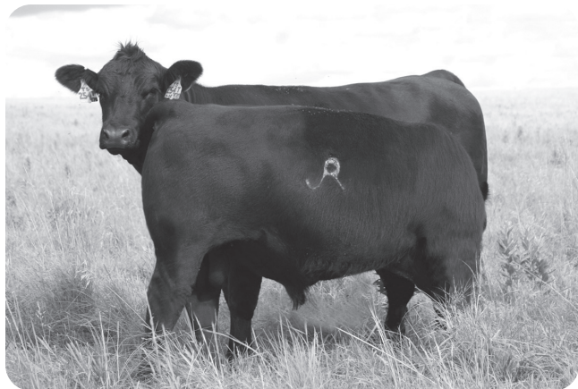
JR First Calf Heifer Nursing Her Scalebusting Bull Calf