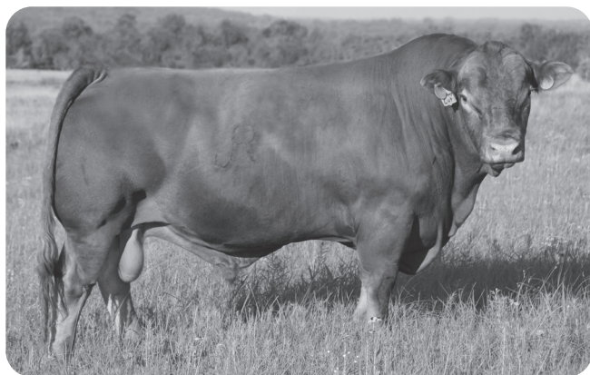
JRI Cowboy Cut 213S67