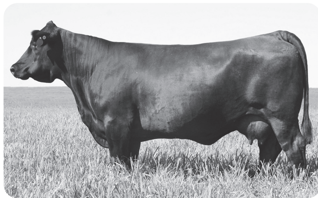
Judd Ranch Mama Photographed at 8 Years of Age

B HP Balancer Bull Scalebusting 1,020# Actual WW Top 35% CE EPD Strength Fertility Plus Meat Machine 98 T & U 367 Day Calving Interval 7-Year-Old Dam