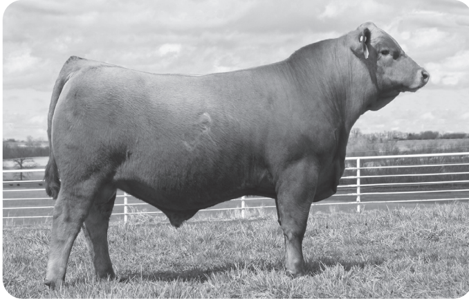
2020 Sale Bull • Full Brother to Lot 200