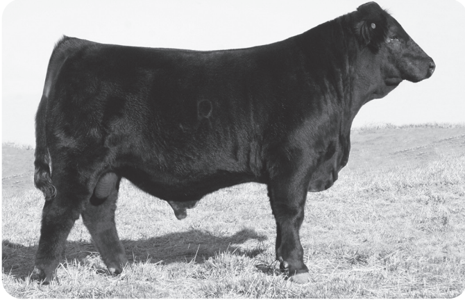
Powerhouse Judd Ranch 2021 Sale Bull