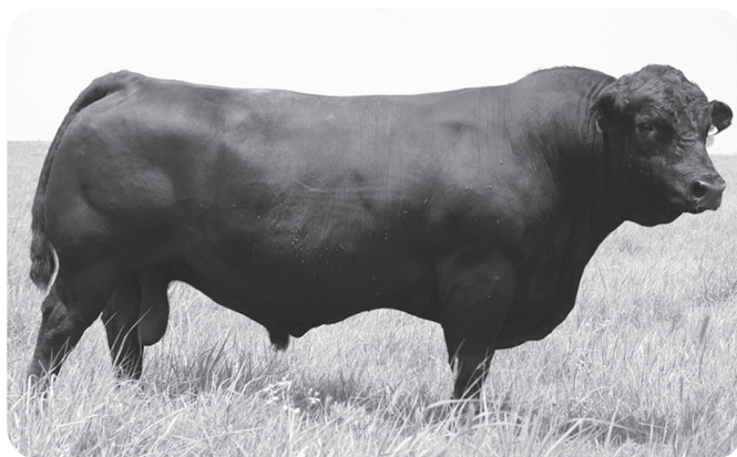
JRI Extra Exposure 285L71 ET

■ JRI Optimizer 148A24 was selected as the top Balancer bull in the fall 2013 calf crop and mercy, check out the phenomenal stats on this calving ease/meatwagon: 72# birth weight, 851# 205 day weight, 990# actual weaning weight...79.5% of his first calf dam's body weight, 1,316# yearling weight, 15.1 square inch yearling ribeye with a 40.3 centimeter yearling scrotal. Optimizer's dam JRI Ms Bella 148Y44 was honored as a Dam of Merit female in her first year of eligibility and wowsa, check out the phenomenal averages on Ms Bella's five natural born son's to date: 81# birth weight, 770# 205 day weight, 927# actual weaning weight with a scalebusting 1,240# yearling weight average. I might add, Optimizer's grandams' 148U34, 148R63, 148J53, 148G4 & 148Y3 were all honored as Dam of Merit females.