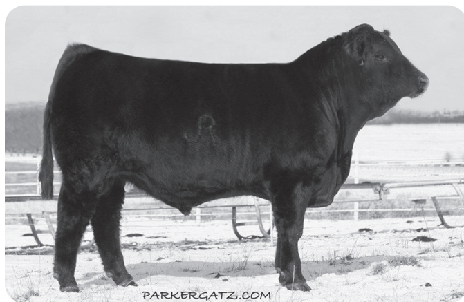
Powerhouse Judd Ranch 2010 Sale Bull