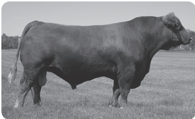
JRI Top Secret 253M75 ET

JRI Reference Sire Homozygous Polled Purebred JRI Top Secret 253M75 ET