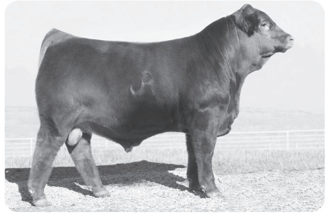
Meat Machine Judd Ranch 2018 Sale Bull

HP PB General Patton Son Scalebusting 1,296# YW CE Deluxe 82# BW Big Ol' 16.7" Ylg Ribeye 5-Year-Old Dam/AI Sire Trade Secret's Full Brother