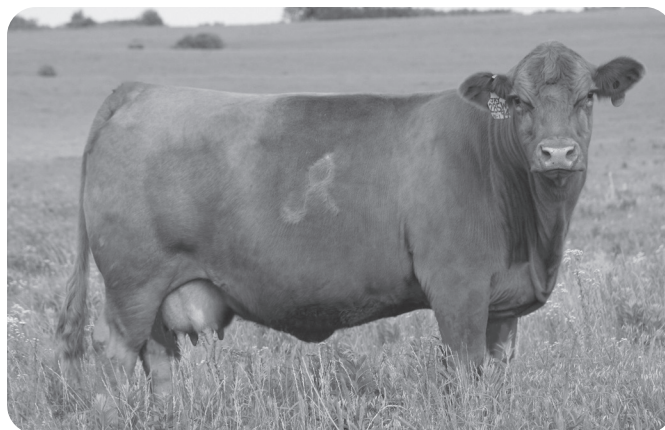
9 Year Old Judd Ranch Dam of Merit Mama

HP Balancer Bull Whopping 1,035# Actual WW CE 85# BW CE Beef Machine Genetics 361 Day CI 6-Yr-Old Dam/Awesome DOD Cow Family