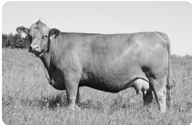
It's All About Cow Power Genetics at Judd Ranch