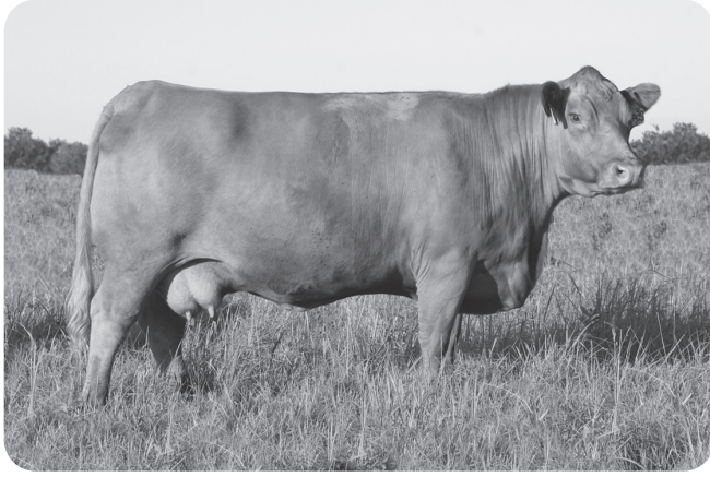
355 Day Calving Interval 7-Year-Old Judd Ranch Mama