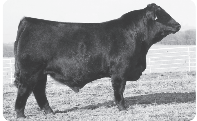
JRI Midnight Rain 68K222 • Lot 262

B HP Balancer Bull Whopping 1,303# YW CE Deluxe 83# BW Big-Time 5 # Gainer Big Ol' 16.9" Ylg Ribeye/6-Yr-Old DOM Honored Dam