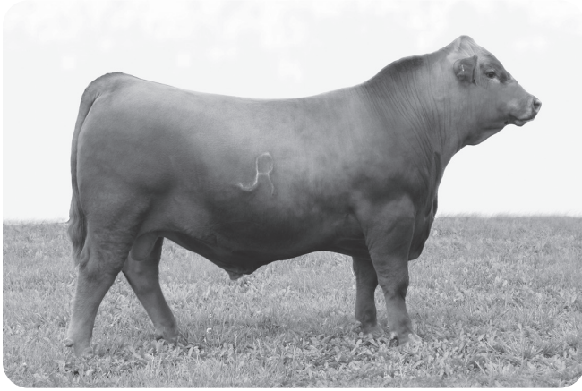
Herd sire JRI Bandito 253H32 • Full Brother to Lot 292