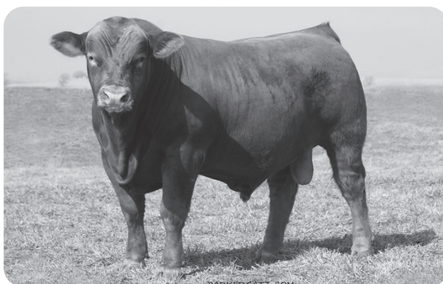
JRI Pop A Top 197T83