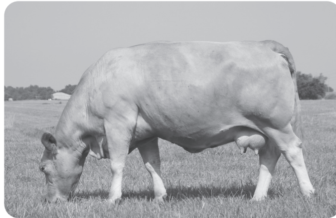
Judd Ranch Mama Photographed at 12 Years of Age

HP Balancer Bull "Heifer Bull" Genetics CE Deluxe 55# BW Top 1% CE EPD Strength Fertility-Plus Genetics/4 CRM DOM Honored Grandams