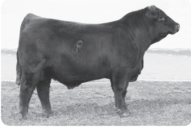
Beef Machine Judd Ranch 2013 Sale Bull