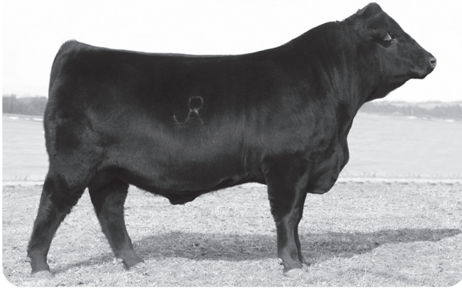
Meat Machine Judd Ranch 2013 Sale Bull