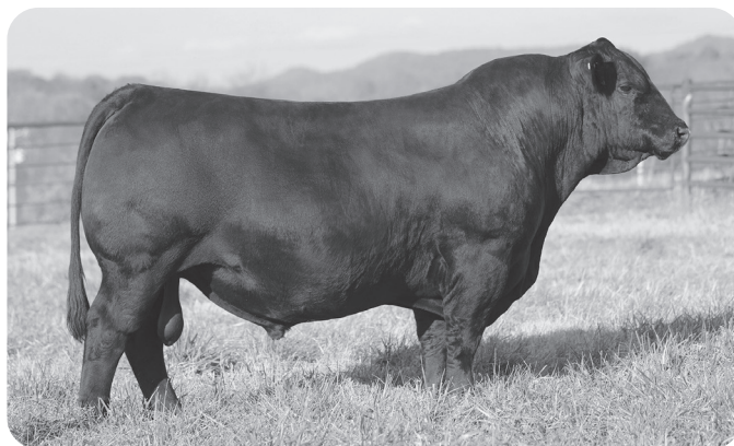
RWG Seminole Wind 9430 ET

■ Judd Ranch purchased Capitol Hill in the spring of 2017 and you talk about a calving ease/meat machine that features unmatched phenotype and genotype. Capitol Hill possesses that Judd Ranch demanded low birth, super growth spread and most importantly fertility and maternal strength. Capitol Hill definitely features a calf raising machine/fertility-plus honored Dam of Merit mama with teat/udder excellence and note Capitol Hill's widespread low birth (84 pounds) to superb growth spread (1,274 pound yearling weight). Capitol Hill sons are calving ease/beefpacking machines and the Capitol Hill daughters are phenomenal fertility-plus/calf raising machines.