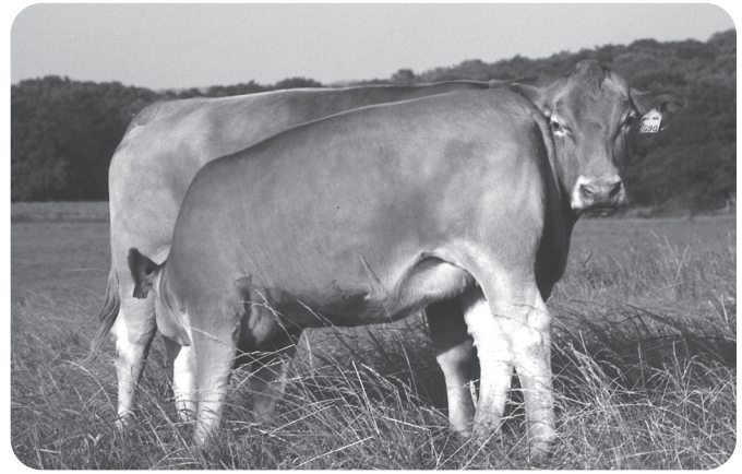
JRI Dam of Distinction Nursing Her Scalebusting Heifer Calf