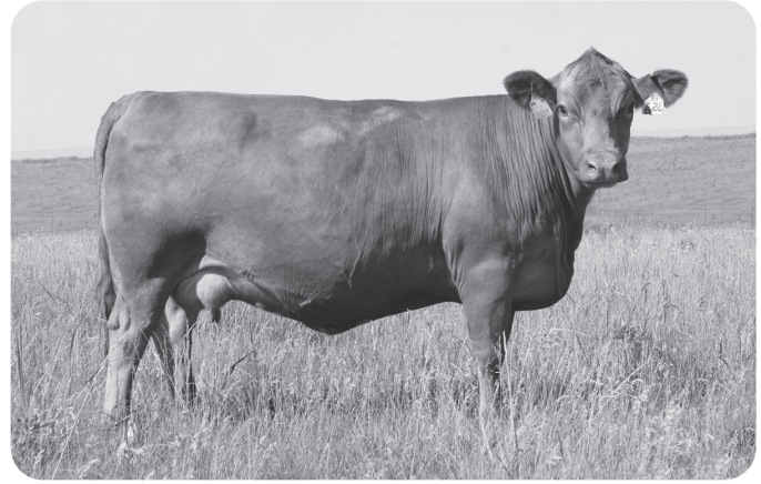
Natural Fleshing Ability is Standard Equipment at Judd Ranch

HP Balancer Bull CE Beef Machine Genetics CE Deluxe 82# BW Fertility-Plus Cow Family 364-Day C I 7-Year-Old Purebred Red Angus Dam