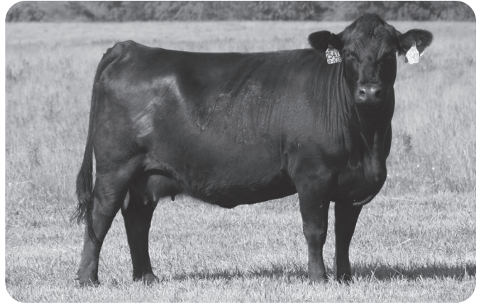
Awesome Judd Ranch Second Calf Heifer

B HP Balancer Bull Carcass-Plus 4.1 IMF CE Deluxe 71# BW CE Beef Machine Genetics First-Calf Dam/Awesome Dam of Distinction Cow Family