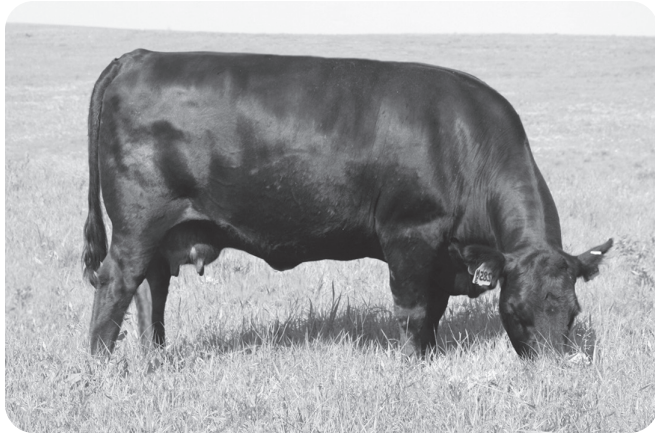
Judd Ranch Females Are The Complete Package