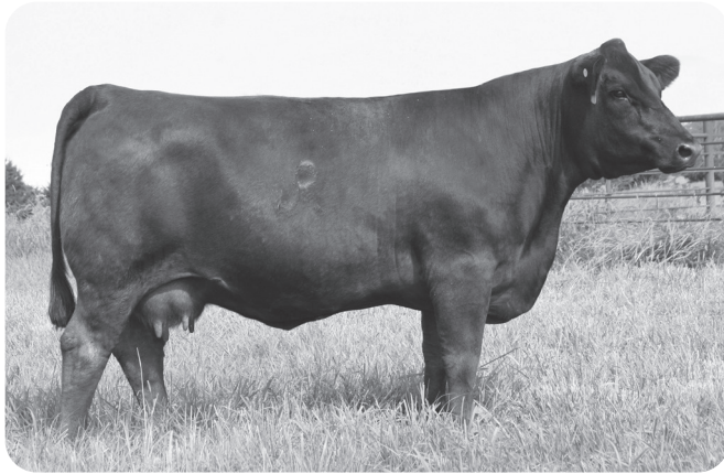
Calf Raising Machine JR Second Calf Balancer Heifer