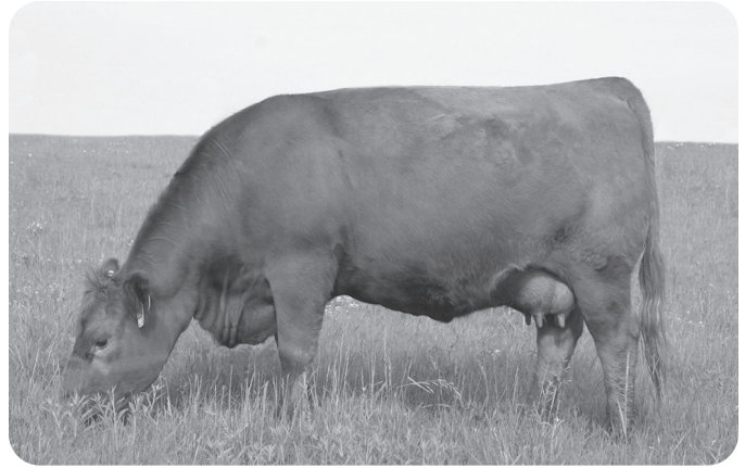
JR First Calf Heifer & Note Her Teat/Udder Excellence

ET HP PB Secret Instinct Son Big-Time 5# Gainer CE Deluxe 75# BW CE Meat Machine Genetics Incredible 6-Year-Old DOM Donor Dam & Cow Family