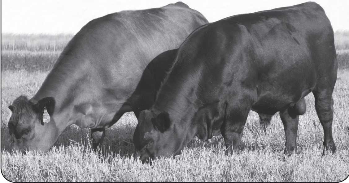
Judd Ranch Mama Photographed as a First Calf Heifer With Her Scalebusting Bull Calf