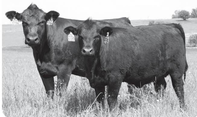
Judd Ranch First Calf Heifer With Her Whopping Heifer Calf

Fertility-Plus 3-Year-Old Dam/Incredible DOD Cow Family