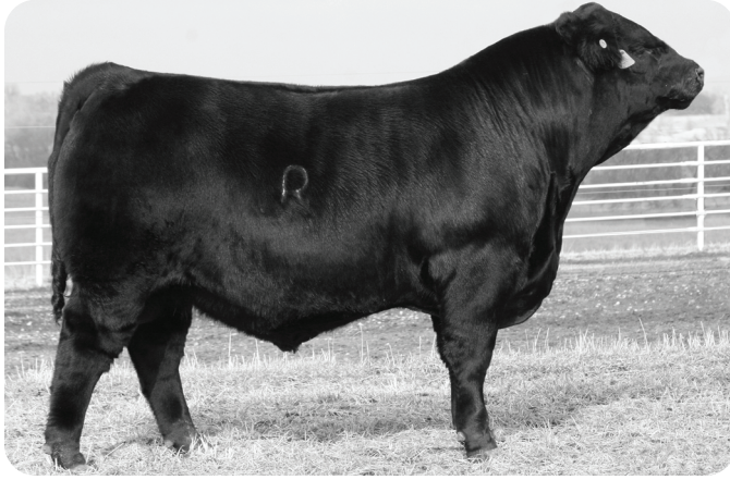
JRI Premium Blend 213J257 ET • Lot 240