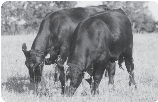
Judd Ranch Fall Bull Calf Pair