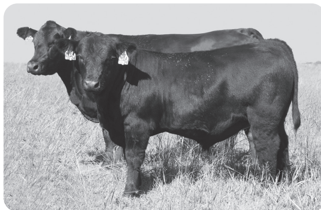
First Calf JR Mama With Her Powerhouse Bull Calf

First-Calf Dam/Awesome JR DOM Cow Family