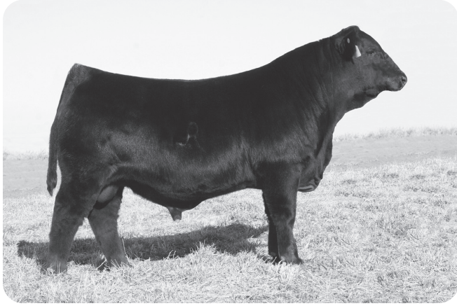
Powerhouse Judd Ranch 2021 Sale Bull