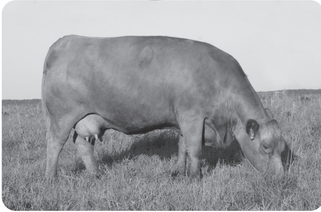
355 Day Calving Interval 7 Year Old Judd Ranch Mama