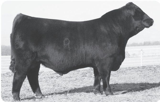
JRI Bonus Plan 214K298 • Lot 252