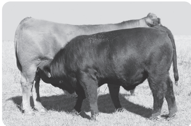
JR First Calf Heifer Nursing Her Meatwagon Bull Calf