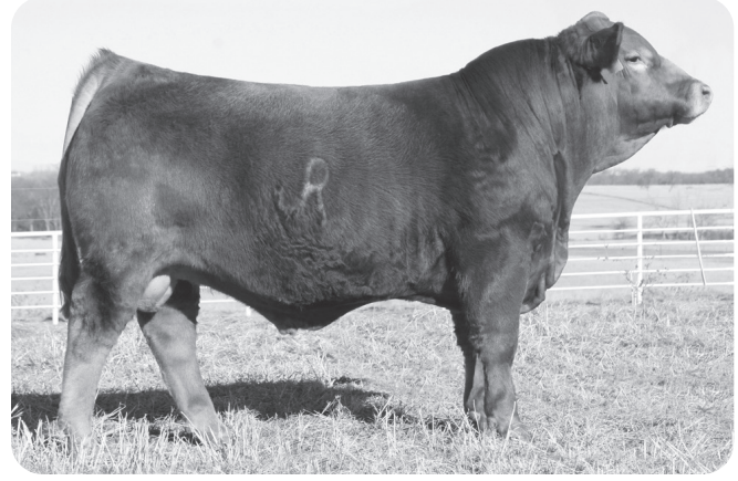
Beef Machine Judd Ranch 2016 Sale Bull

HP PB Secret Instinct 2 Son Scalebusting 1,300# YW CE Deluxe 73# BW Humongous 43.3 cm Ylg Scrotal CRM First-Calf Dam/4 CRM DOM Honored Grandams