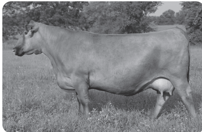
JR Purebred Red Angus Females are "The Complete Package"

Beef Machine Genetics Top 29% Marbling EPD Strength Super T & U 369-Day C I 6-Year-Old Dam