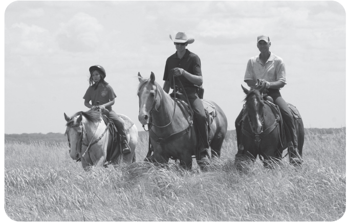
It's All About Family Ranching At Judd Ranch

B HP Balancer Bull Big-Time 5# Gainer CE Deluxe 78# BW 15" Ylg Ribeye/4.9 IMF First-Calf Dam/3 CRM DOM Honored Grandams