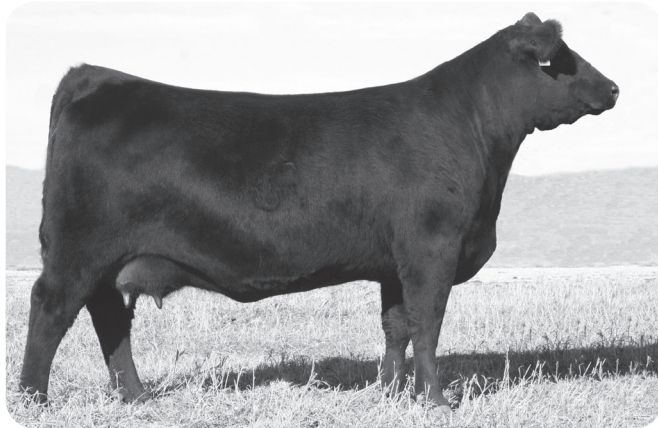
Beautiful Judd Ranch Balancer First Calf Heifer