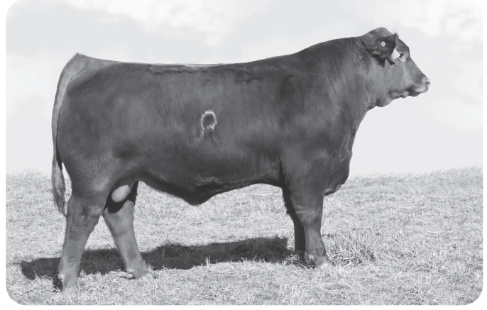
Meat Machine Judd Ranch 2021 Sale Bull

HP Balancer Bull Whopping 1,259# YW CE Deluxe 66# BW "Heifer Bull" Genetics 99 T & U Score Dam/Awesome JR CRM Cow Family