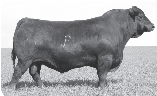
JRI Marshall 214X2

■ JRI Alan 68G3 was the super stud lead bull in Judd Ranch's 2020 National Champion Pen of 3 Bulls and Runner Up in the 2020 Balancer Futurity. Alan nursed a first calf heifer with an awesome teat and udder system and note Alan's phenomenal stats: 82# birthweight, 836# 205 day weight, 1,065# actual weaning weight, and 1,382# yearling weight. Alan's first-calf dam JRI Ms My Payday 68E2's unbelievable producing ability definitely comes as no surprise as Alan's grandam's 68Y8, 68G6, and 68B5 were all honored numerous times as fertility-plus/calf raising machine Dam of Merit females. Alan features "The Complete Package" of calving ease, growth, fertility, carcass, and his progeny should really excel in carcass merit as Alan posted a carcass-plus 115 intramuscular fat ratio.