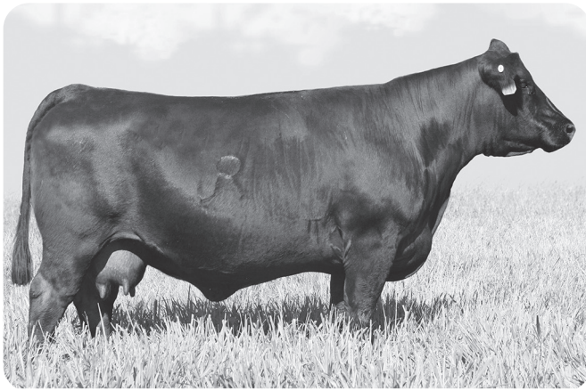
Judd Ranch Mama Photographed at 8 Years of Age