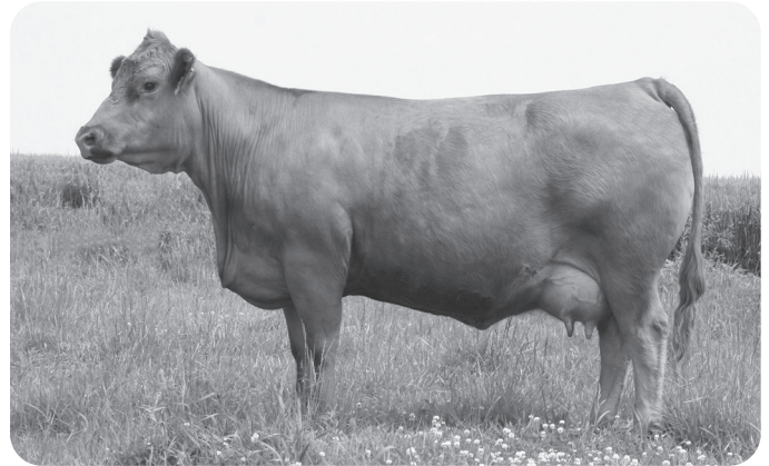
General Patton's ET Full Sister Photographed at 7 Yrs of Age

HP PB Painted Black Son Top 10% CE EPD Strength CE Deluxe 70# BW CE Beef Machine Genetics First-Calf Dam/Powerful JR Dam of Merit Cow Family