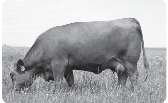
Teat and Udder Quality is Standard Equipment at Judd Ranch

HP PB General Patton Son Huge 16.1" Ylg Ribeye 77# Avg BW on Dam's 3 Calves Carcass-Plus 4.3 IMF Beautiful T & U Third-Calf Dam/CRM DOM Cow Family