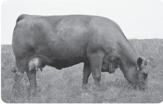
Lot 44's Calf Raising Machine Donor Dam