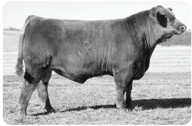
JRI Bonanza 254K426 • Lot 199

ET HP PB Secret Instinct Son Scalebusting 1,329# YW Top 25% CE EPD Strength Whopping 955# Actual WW 10-Year-Old DOD Donor Dam/Herd Sire Secret Powers Full Brother