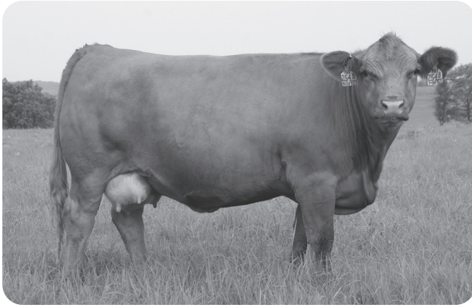
6 Year Old Calf Raising Machine Judd Ranch Mama