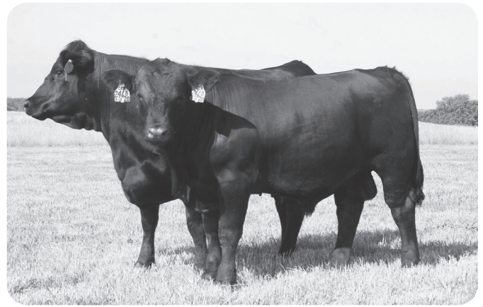
Judd Ranch Scalebusting Bull Calf With First Calf Mama

366-Day Annual Calving Interval 12-Year-Old Dam