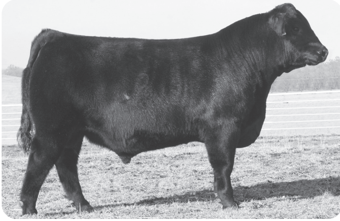
JRI Paid In Full 253K224 ET • Lot 245