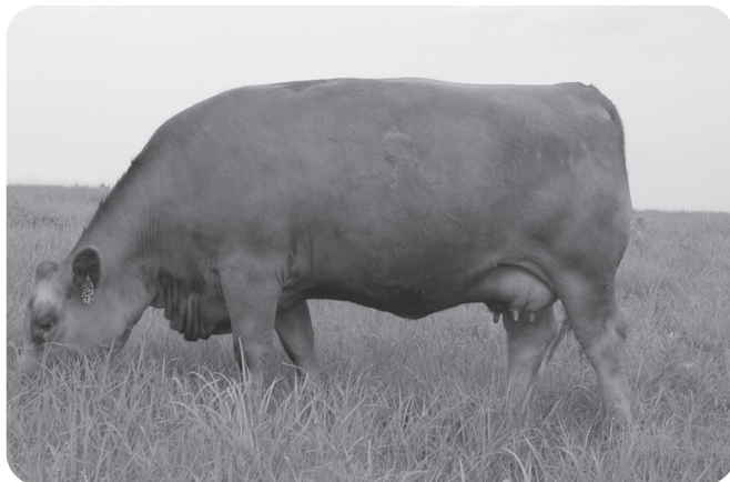
Awesome Judd Ranch Second Calf Heifer