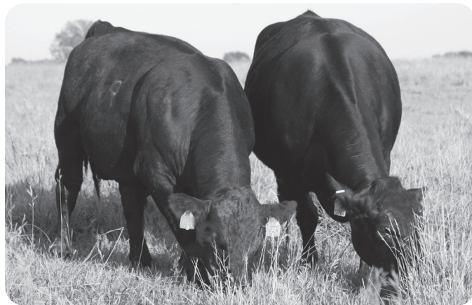
Judd Ranch Fall Bull Calf Pair

HB HP PB Secret Instinct Son Whopping 915# Actual WW CE Deluxe 82# BW Big-Time 6# Gainer Incredible CRM Dam of Merit Dam & DOM Cow Family