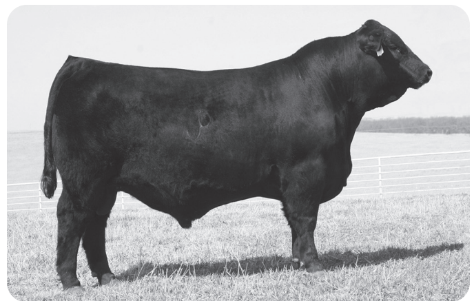
Powerhouse Judd Ranch 2018 Sale Bull

HB HP Balancer Bull Big-Time 6# Gainer Scalebusting 1,463# YW Beefpacking Machine Genetics CRM First-Calf Dam/3 CRM Dam of Distinction Grandams