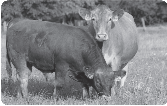
Judd Ranch Mama With Her Meat Machine Bull Calf