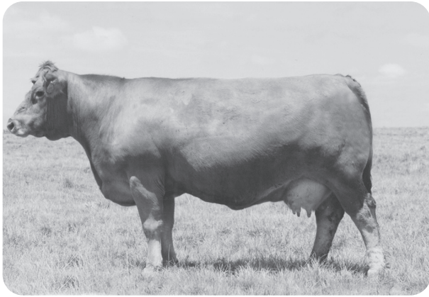
Judd Ranch Mama Photographed at 9 Years of Age