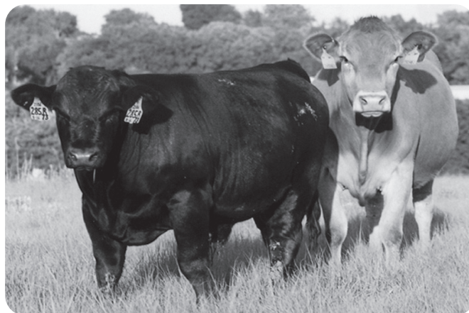
Judd Ranch First Calf Heifer With Her Whopping Bull Calf

DB HP Balancer Bull Big-Time 5# Gainer "Heifer Bull" Genetics 15" Ylg Ribeye/3.9 IMF 342-Day CI 99 T & U Dam/Incredible DOM Cow Family