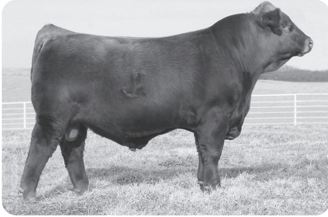
Meatwagon Judd Ranch 2017 Sale Bull