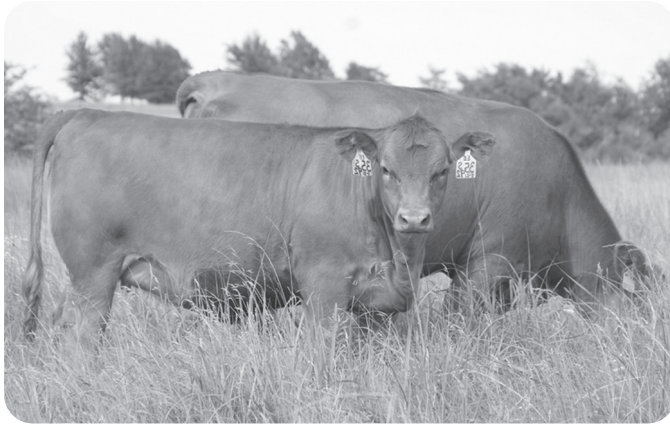
Judd Ranch First Calf Heifer With Her Beautiful Heifer Calf