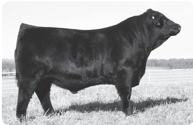
Meatwagon Judd Ranch 2019 Sale Bull