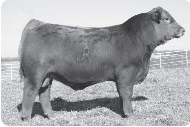
Beefpacking Machine Judd Ranch 2021 Sale Bull