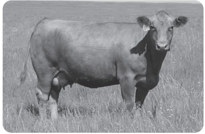
Teat & Udder Excellence is Standard Equipment at Judd Ranch

HP PB Porterhouse Son Scalebusting 1,347# YW Top 25% CE EPD Strength Big-Time Gainer 15.4" Ylg Ribeye/4.2 IMF/9-Year-Old DOM Honored Dam