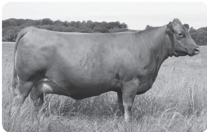
Calf Raising Machine JR Dam of Merit Mama