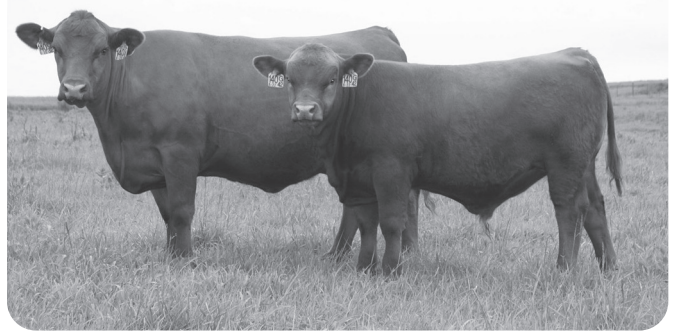
JRI Dam of Merit Mama with Her Powerhouse Bull Calf

Calf Raising Machine Third-Calf Dam of Merit Dam