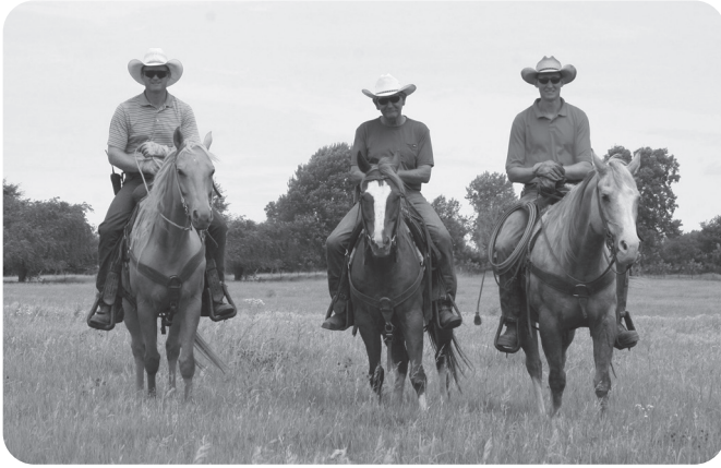
Part of the Judd Ranch Crew Getting Ready for Roundup