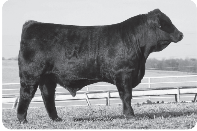
Meatwagon 2009 Judd Ranch Sale Bull

DB HP Balancer Bull Whopping 1,337# YW CE Deluxe 74# BW Big-Time Gainer Weaned Off at 73.1% of His Dam's Body Weight