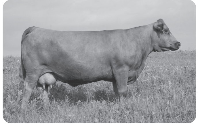
Judd Ranch Mama Photographed at 12 Years of Age

HP Balancer Bull Scalebusting 1,353# YW CE Deluxe 73# BW Big-Time 5# Gainer 362-Day Calving Interval 7-Year-Old Dam of Merit Dam