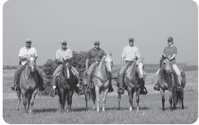
Judd Ranch Crew Getting Ready for the Roundup

B HP Balancer Bull Big-Time 5# Gainer Scalebusting 1,427# YW Carcass Premium 6.1 IMF CRM Second-Calf Dam/3 Incredible DOD Honored Grandams