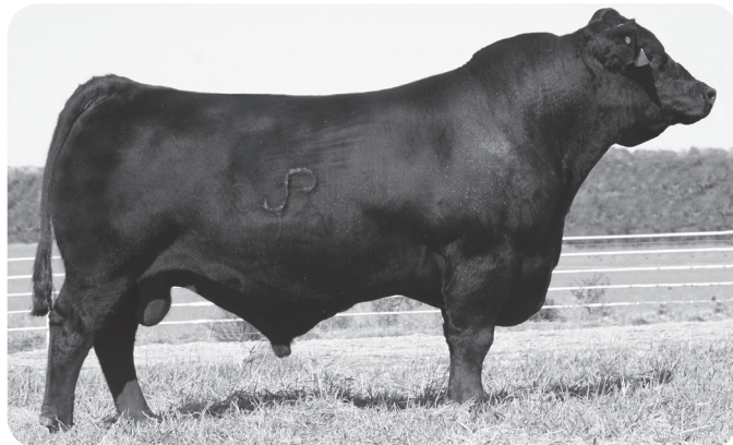
JRI Alan 68G3

■ Wow, you talk about a calving ease/meatwagon Judd Ranch herdsire who's producing phenomenal progeny. Prescribed Remedy's incredible dam JRI Ms Special Blend 253W28 was honored three consecutive years as a Dam of Merit female and wowza, Special Blend has been a one-of-a-kind producer. Special Blend's first calf JRI Ms Lucy 253Y38 is one of Judd Ranch's elite donor females and Ms Lucy's first calf was JRI Ms Victoria Secret 253A48 who happens to be the incredible dam of the herdsire JRI Overachiever 253E39. Special Blend daughters and granddaughters are phenomenal producers, now pencil-in Special Blend's ability to produce calving ease/powerhouse sons as Special Blend's first son JRI Secret Password 253Z38 sold in the 2013 bull sale and the super stud reigned as the 2014 Canadian National Champion Bull.