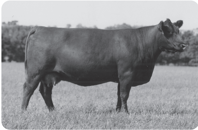
Judd Ranch Foundation Purebred 1A Red Angus Female