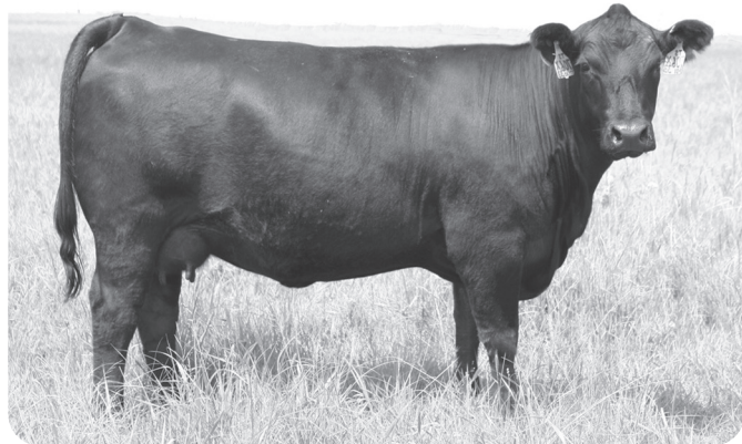
Beautiful JR Balancer Female Photographed as a First Calf Heifer