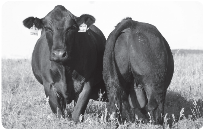
JR Dam of Merit Nursing Her Beef Machine Bull Calf