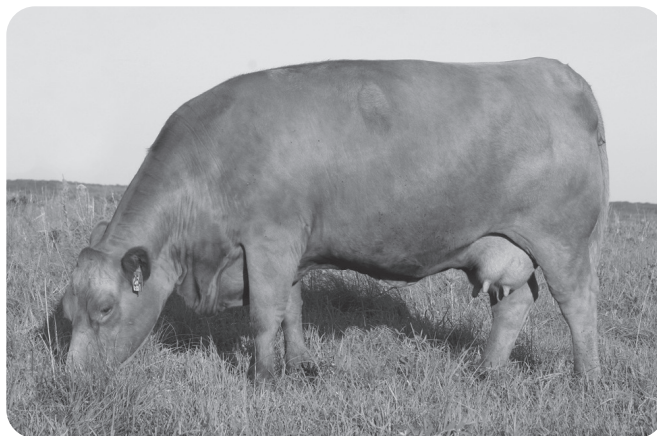
Beautiful 7 Year Old Judd Ranch Mama

ET HP Balancer Bull Scalebusting 1,075# Actual WW Top 10% CE EPD Strength Meatwagon Genetics 11-Year-Old CRM Dam of Distinction Donor Dam