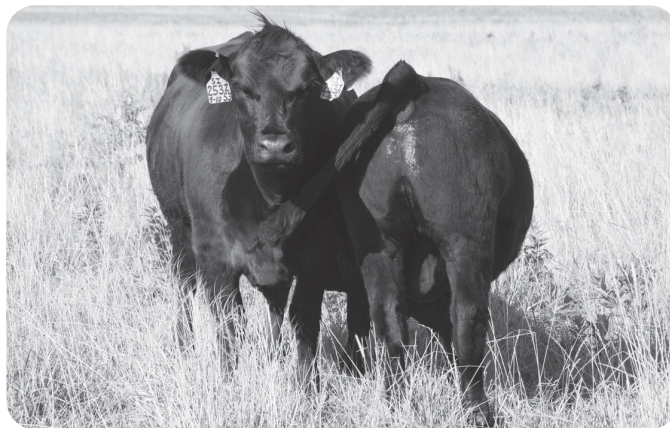
JR First Calf Heifer Nursing Her Scalebusting Bull Calf