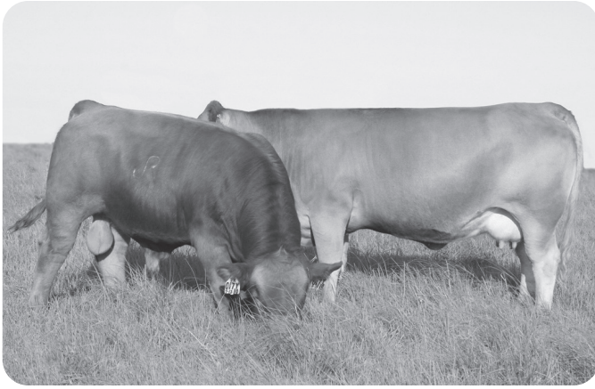
JR Mamas Flat Know How to Produce Powerhouse Sons