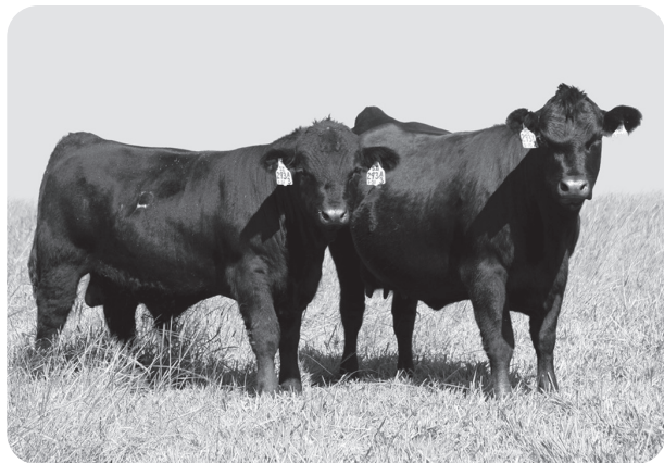
First Calf JR Mama With Her Beef Machine Bull Calf