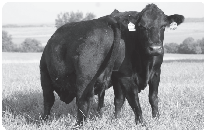
JR Dam of Distinction Nursing Her Meat Machine Bull Calf

ET B HP PB General Patton Son Whopping 940# Actual YW CE Deluxe 75# BW CE Beef Machine Genetics CRM Dam of Merit Donor Dam/Awesome DOM Cow Family